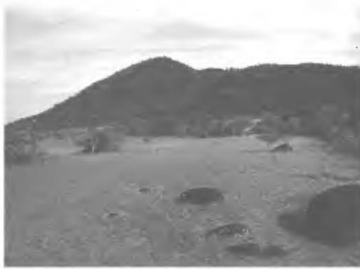
FIG. 2. Red Siskin habitat in the Rupununi, Guyana. Photograph taken from top of granite dome (in foreground). The savanna has been subjected to repeated burning and, as a result, woody vegetation had been reduced and the savanna and deciduous woodland interface was abrupt. Photographed October 2000 by M. Robbins.

habitat—the savanna and semihumid woodland interface—in the Rupununi of Guyana. Because of the area's inaccessibility and rough terrain, surveys were made on foot.